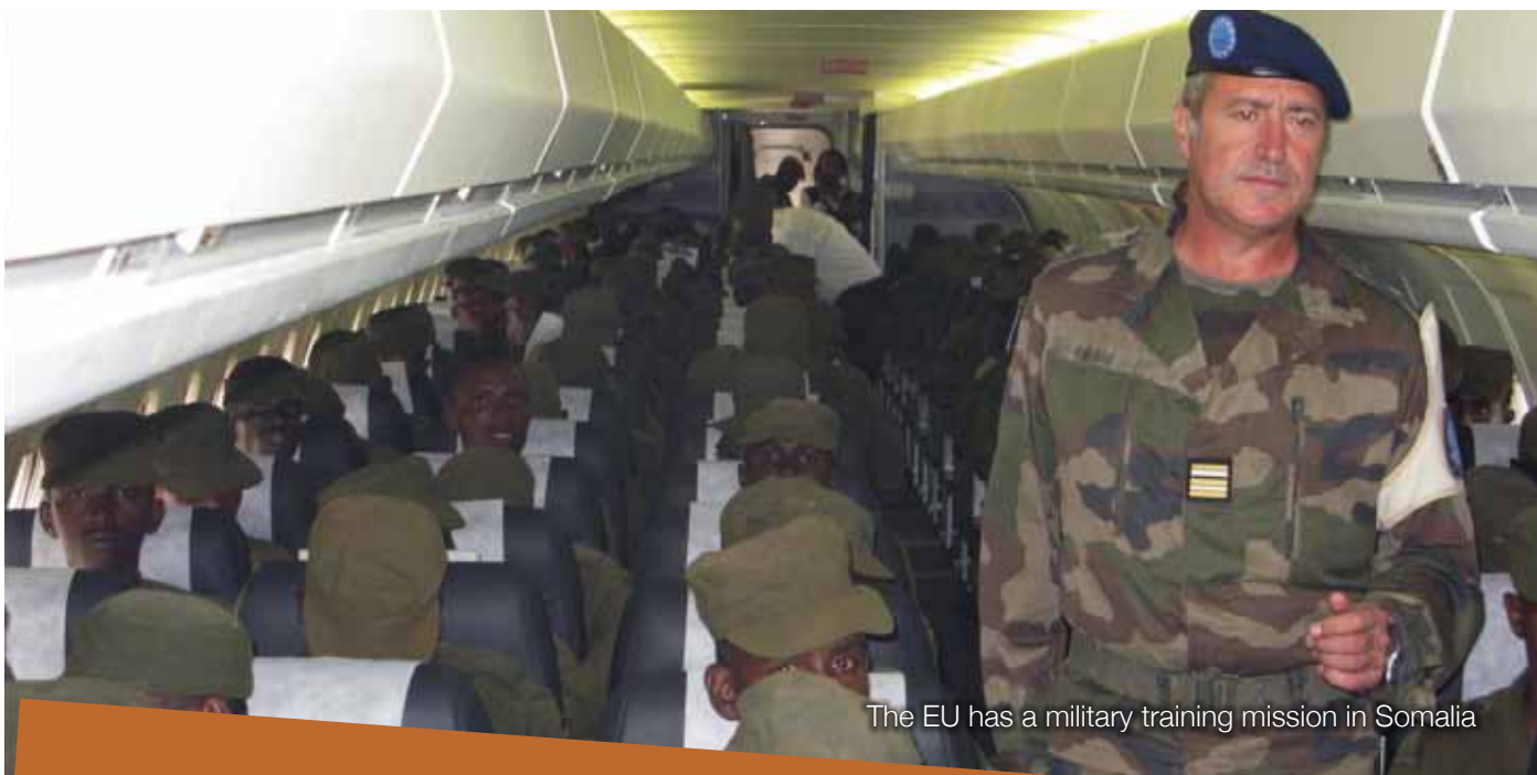
The EU has a military training mission in Somalia

At country level, EEAS and DEVCO staff project different messages. Thus far, there is no comprehensive development training for staff nor a staff policy. One year on, it is important that all EEAS and delegation staff have a shared and consistent understanding of EU development policies and how they need to be implemented in country. DEVCO faces a unique challenge in taking on personnel responsibilities for all development staff in delegations and integrating them with Brussels based staff. It will allow in future for a more coherent development profile in the Commission with staff rotating to delegations depending on expertise and need. This could in the end be to the benefit of partner countries.