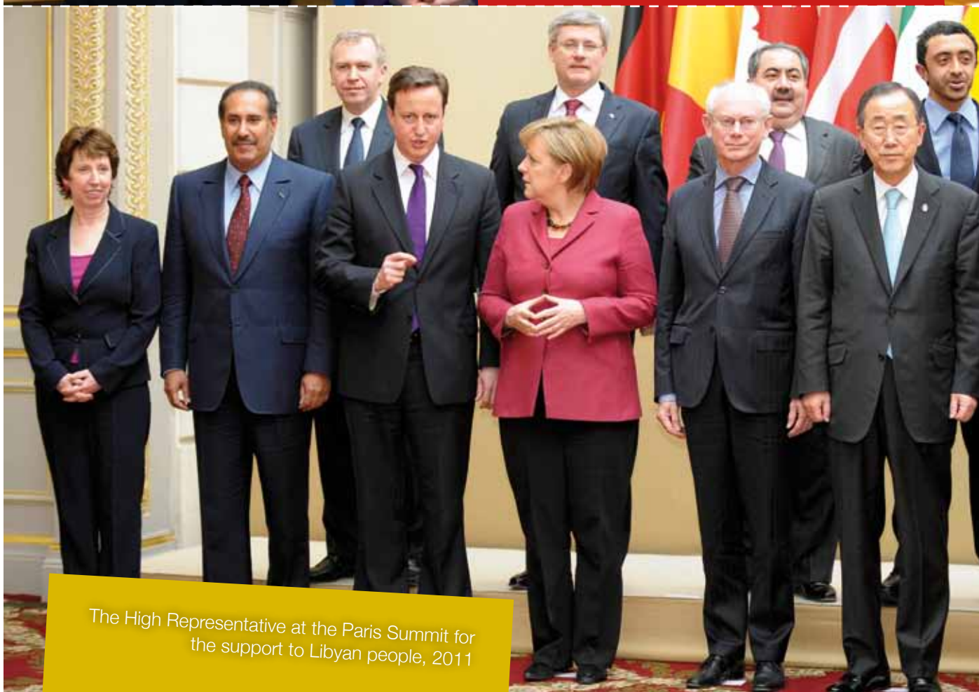
The High Representative at the Paris Summit for the support to Libyan people, 2011