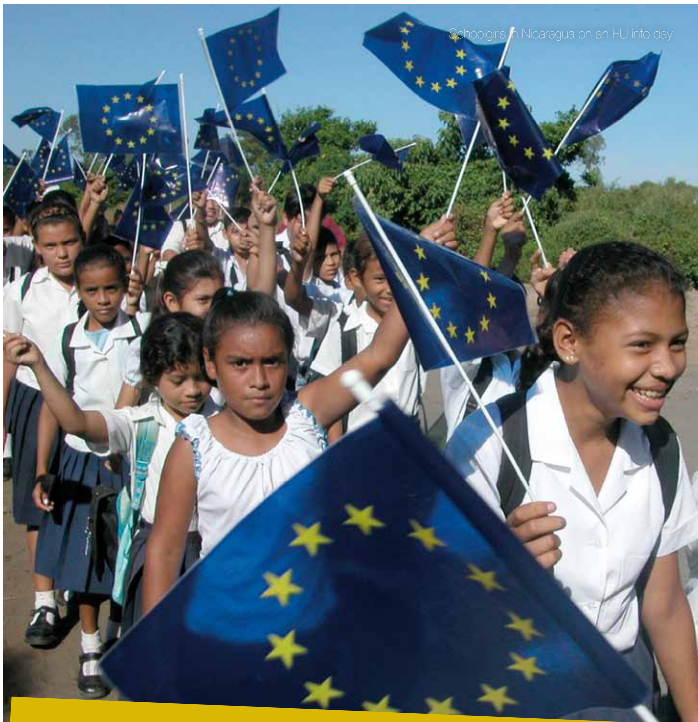
Schoolgirls in Nicaragua on an EU info day

→ 'EARLIER "SILOS" BETWEEN SECURITY, HUMAN RIGHTS, AND DEVELOPMENT ARE STARTING TO BREAK DOWN... HOWEVER THE BALANCE IS WAVERING BETWEEN POLICIES MAINLY IN THE EU'S SHORT-TERM INTERESTS, AND THOSE IN THE BEST LONGER-TERM INTERESTS OF DEVELOPING COUNTRIES' (AND THEIR POOR AND MARGINALISED COMMUNITIES).